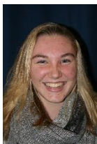
Princess Chop Suey