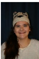
Cha Cha the dancing panda